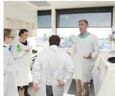
Certificate III in Laboratory Skills